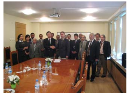
(Left) Kickoff meeting in Tokyo, June 2007, (Right) The 2 nd session of the IPRED in Istanbul, July 2009