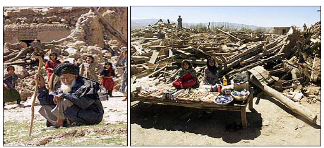
Fig (2) an elderly Afghan man squats near the rubble of several houses demolished earthquake in Nahrin.