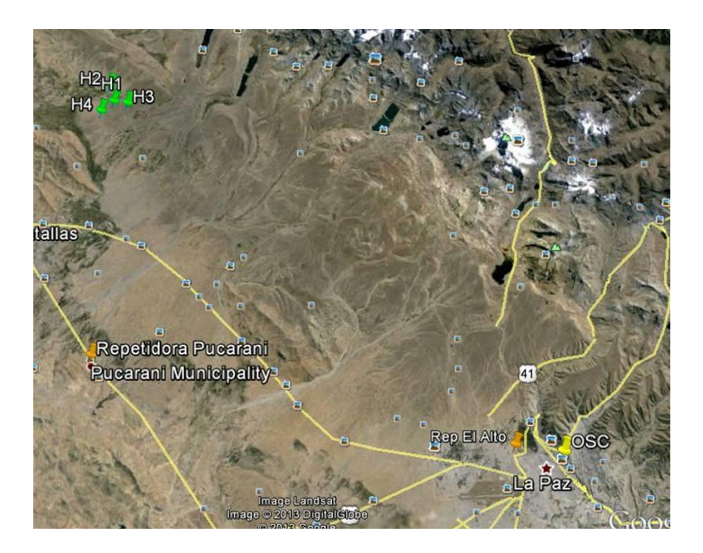
Figure 2(a). Seismic Network (detail).