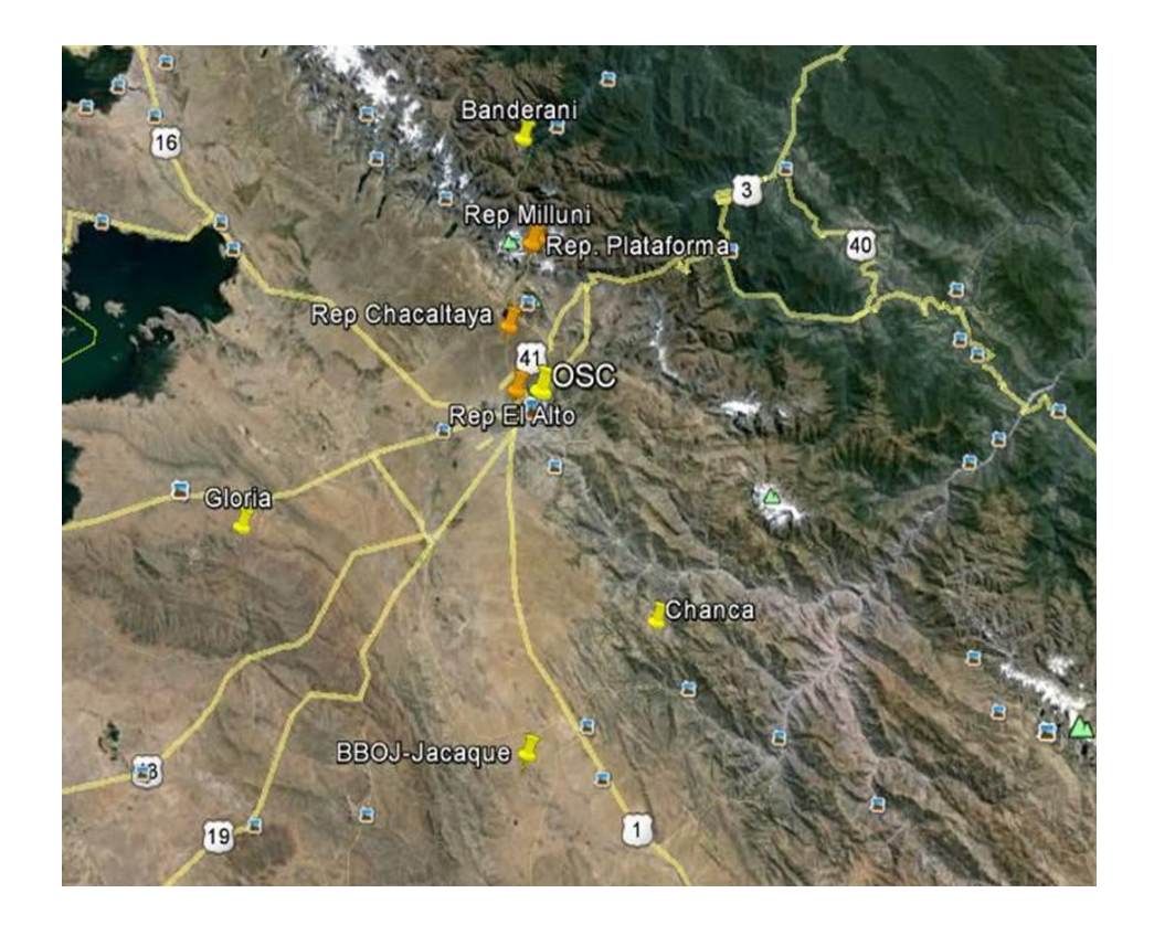
Figure 2(c). Seismic Network (detail).

The Observatorio San Calixto has five seismic stations which were installed around La Paz before 2010. All of them are short period with one vertical component operated under the French cooperation. These stations are all analog with also telemetric analog transmission. Outside La Paz there are two stations, which are digital and composed by three short period sensors and three long period sensors. They belong also to the French cooperation and they are a part of the IMS as AS08 station. In La Paz we also installed one infrasonic array near to "Peñas" town; it is also a part of the IMS as IS08 station with the French cooperation. We have one station called PS06 near Milluni; it is a station with one short period and one broad band three component stations, which is also a part of IMS with the AFTAC cooperation.