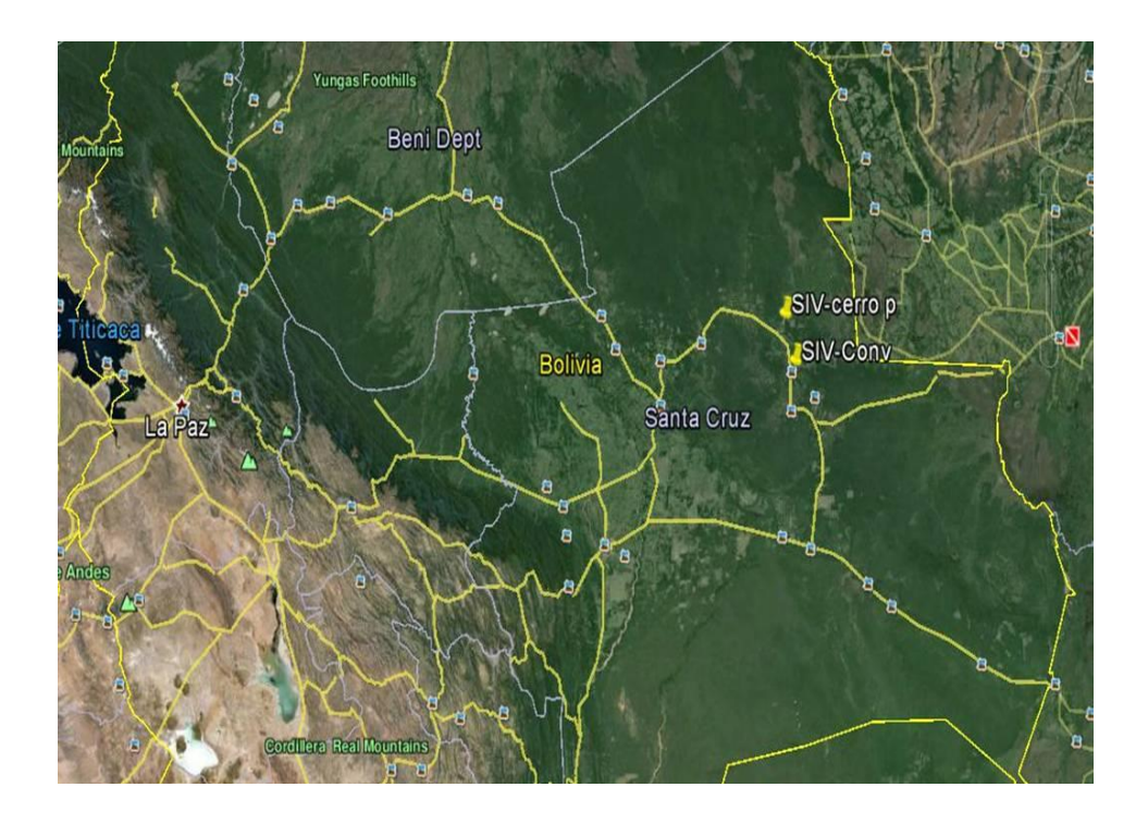
Figure 2(b). Seismic Network (detail).