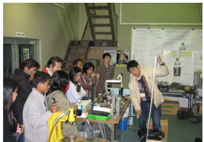
S course at Tohoku Univ.

The participants had a lot of precious experiences related to the daily studies at IISEE. We hope they will exploit the knowledge that they have learned during this study trip effectively for their specialized fields.