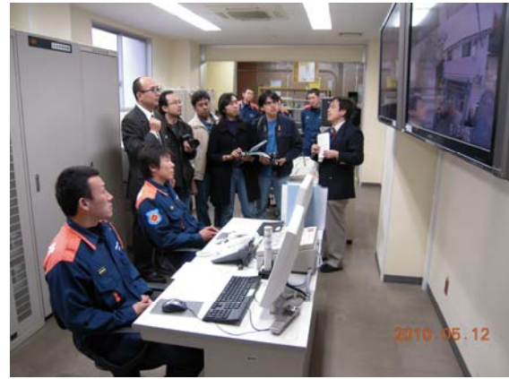
T course at Ofunato Fire Department