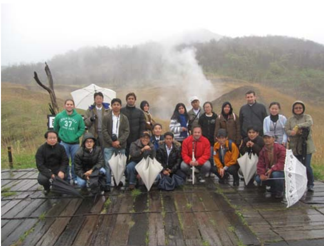
S&E courses at Mt.Usu

We conducted the study trip on the regular course from 10th to 14th May. The principal places to visit were as follows.