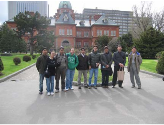
E course at Former Hokkaido Government Office