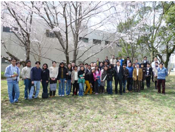
Sakura in April