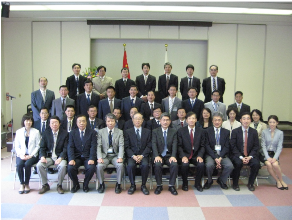
Group photo at the opening ceremony

This is a two-month training course, and this time we invite 20 participants from all around China. They will study "Seismic Resistant Design" and "Seismic Evaluation and Seismic Retrofit" in the IISEE for two months. They are expected to disseminate the antiseismic technologies into all over China, which they will acquire in this course.