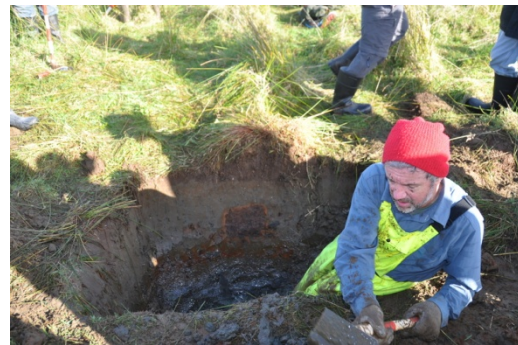
Tsunami deposits in Chuyaquen (left) and Maullin (right)