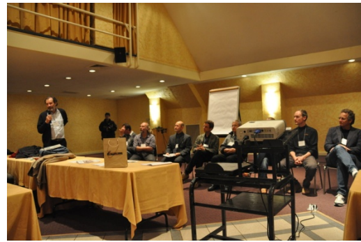
Panel discussion after the poster session