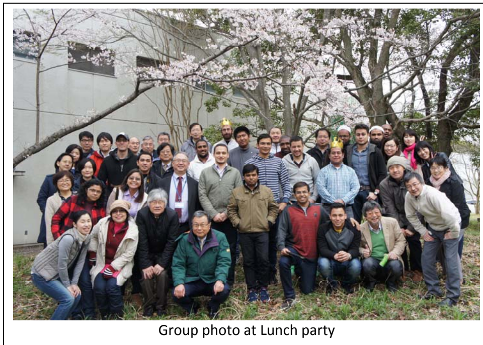
Group photo at Lunch party