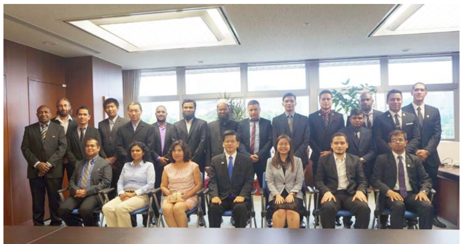
21 Participants made a courtesy call on Mr. Ishii, Minister of Land, Infrastructure, Transport and Tourism, 2016