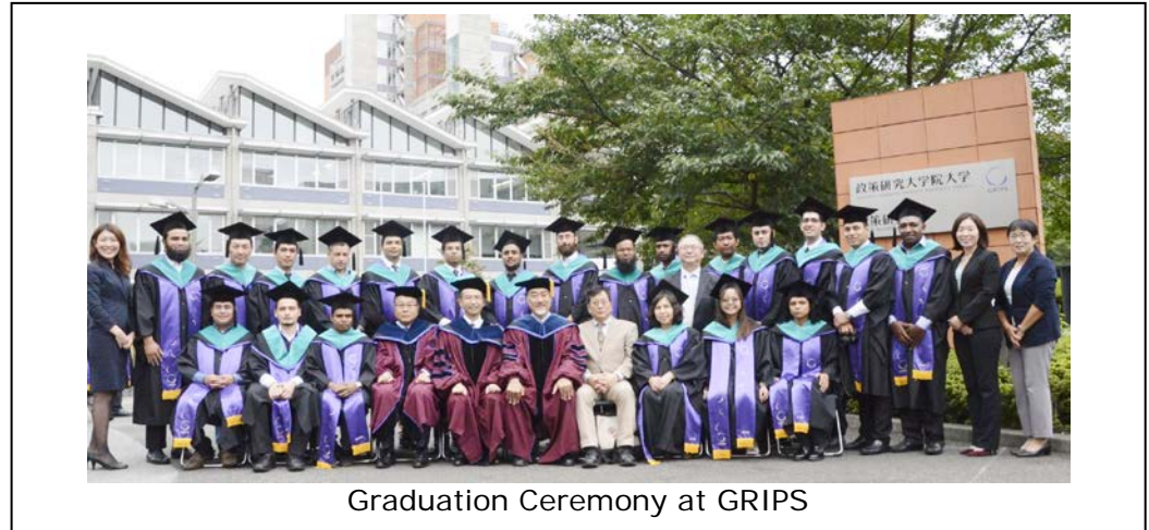
Graduation Ceremony at GRIPS