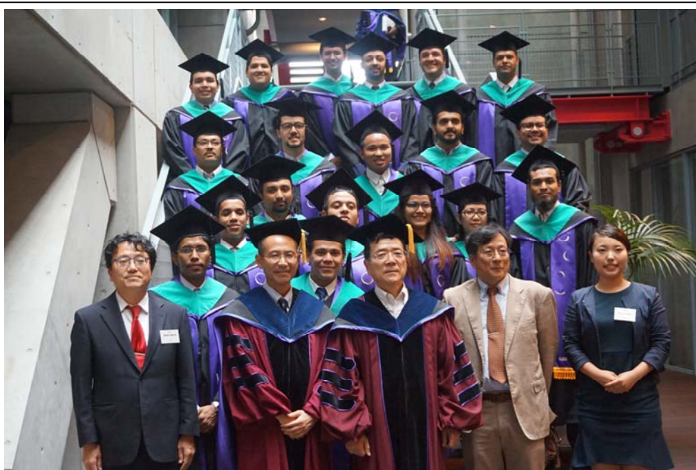
GRIPS Graduation Ceremony

We appreciate everyone for understanding and cooperation to conduct this training course. Thank you very much.