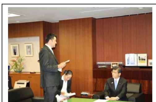
Representative of the Participants