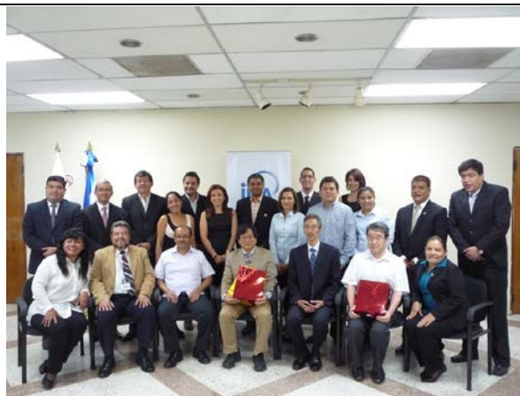
The Closing Ceremony of the 1st Latin American Earthquake Engineering Course at San Salvador, El Salvador

It was a happy and heartwarming time with the fourteen participants who have fully attended from June 5, and eleven more persons who partly attended in the city of San Salvador from July 21.