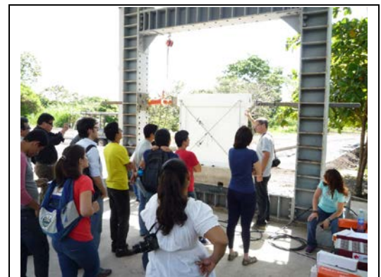
Photo 2: Preparation of loading to the wall specimen confined concrete brick masonry in the UES laboratory

After the tests, the summary of test results was presented by professors, and the building codes for confined masonry structures in each country were also presented generally by participants to exchange the latest technical information.