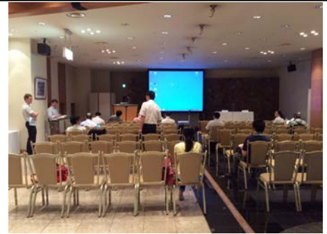
Tsunami session room before starting presentations