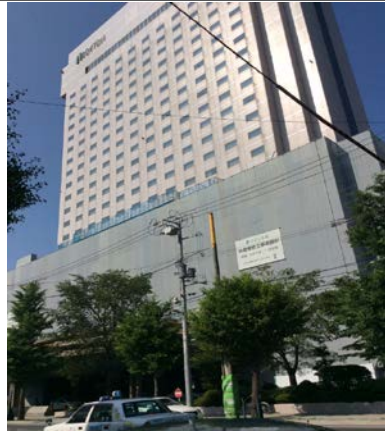
The venue, Royton Sapporo