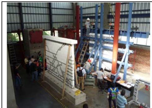
Photo 1: Preparation of loading to the large scale wall specimen confined concrete brick masonry (white part in right side) in the UCA laboratory

It was held from 21 July to 31 July. The lectures are mainly composed of the