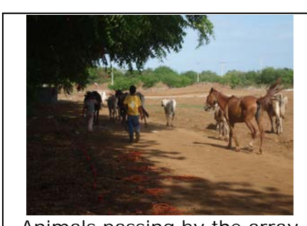
Animals passing by the array

We also visited the National University of Engineering (UNI) and the Nicaraguan Institute of Territorial Studies (INETER) to conduct the observations on the premises. I lectured on basics microtremor