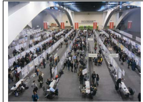
Poster sessions at the Moscone Center