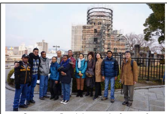
G course Participants in front of A-bomb Dome in Hiroshima

On the 6th, we visited the Nojima Fault Preservation Museum in the Hokudan Earthquake Memorial Park in Awaji Island to observe the preserved surface fault.