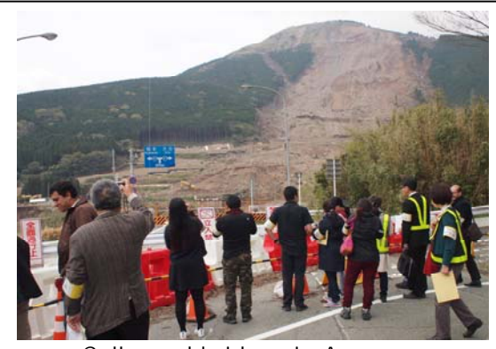
Collapsed bridges in Aso area