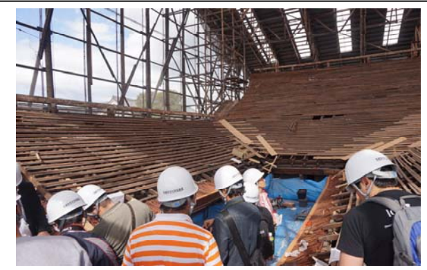
Architectural Preservation site in Toji, Kyoto