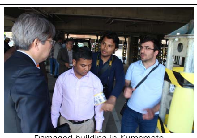
Damaged building in Kumamoto