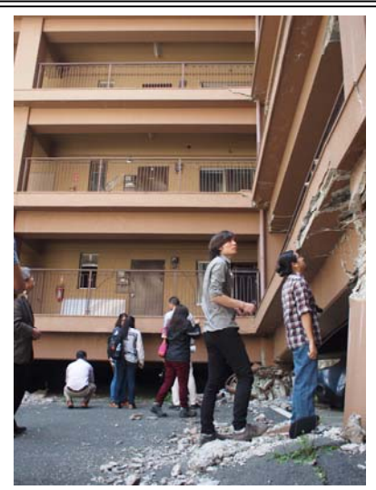
Damaged building in Kumamoto