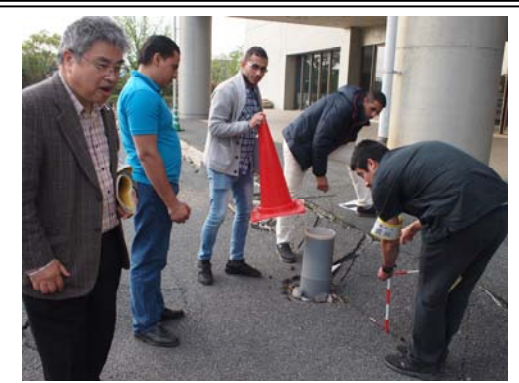
Liquefaction inspection in Mashiki in Kumamoto