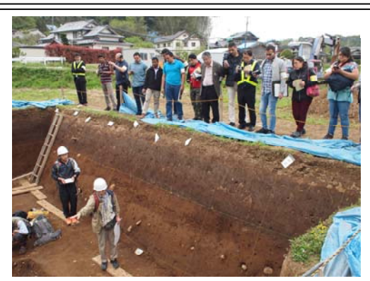
Fault inspection in Mashiki in Kumamoto