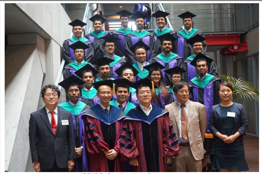
GRIPS Graduation Ceremony

We appreciate everyone for understanding and cooperation to conduct this training course. Thank you very much.