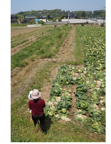
Earthquake fault observation Mashiki Town, Kumamoto