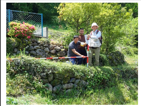
Earthquake fault observation Mashiki Town, Kumamoto