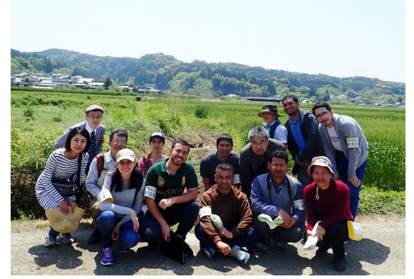
Mashiki Town, Kumamoto