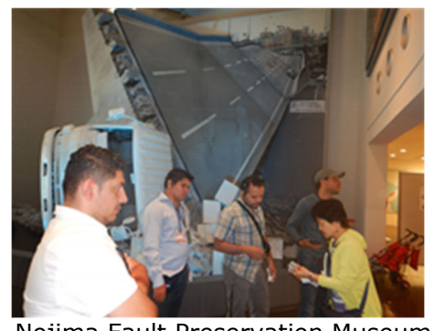
Nojima Fault Preservation Museum

hoping that it will be as profitable as possible for our own interests as well as those of our countries.