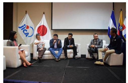
Photo.3 Panel Forum: "the role of scientific research in earthquakeresistant construction."