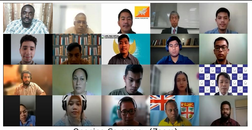
Opening Ceremony (Zoom)

We will strive to make training fruitful for each participant. Also, we hope all the participants come to Japan soon and spend time in Japan with many funs. We highly appreciate the support of all the concerned people for this training course.