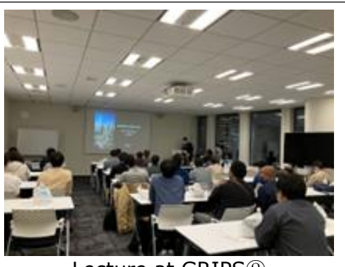
Lecture at GRIPS<sup>(2)</sup>

professional lectures on disaster management policy conducted by GRIPS from November 8th to 21st.