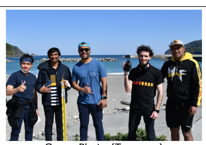
Group Photo (T-course)

To sum up, this trip was eye-opening and informative, and I enjoyed every single day of it. I must comment on this great initiative in allowing participants to observe the destruction that can be caused by these two natural disasters, namely earthquakes and tsunamis.