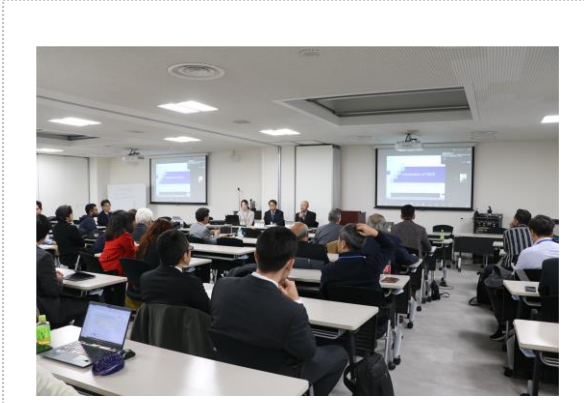
Alumni Opinion Exchange Meeting

After the conference, 3. an in-person social gathering event was held. It was a pleasant opportunity to interact with former and current IISEE staff members as well as participants.