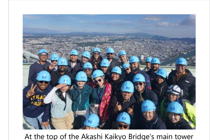
View from the top of the Akashi Kaikyo Bridge's

I would like to extend my sincere gratitude to everyone who contributed to organizing this trip, particularly JICA and BRI, for offering us such valuable insights and new perspectives.