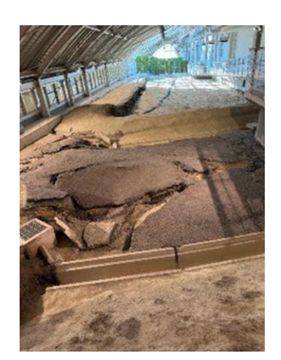
The Nojima Fault