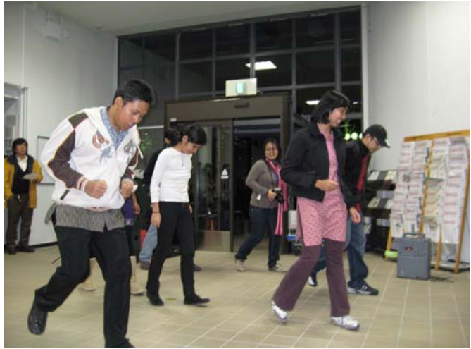
A scene of the party