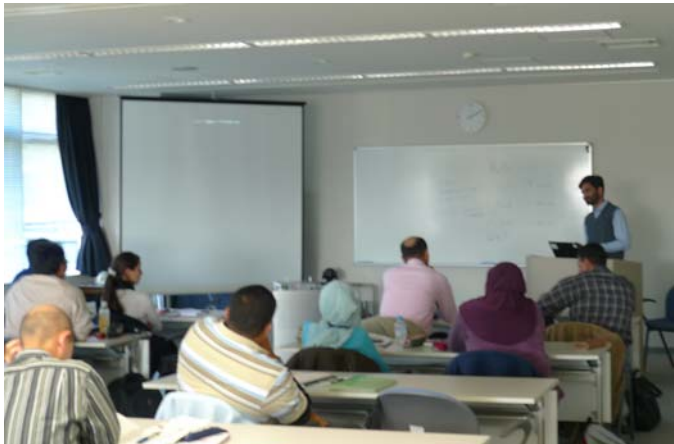
Group photo at the opening ceremony