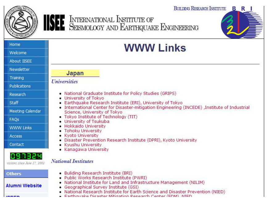
WWW Links on IISEE website

If you can add your organization in this page, please inform us the URL.