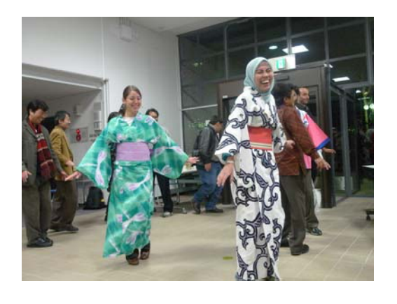
Dance performance by participants