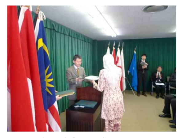
Award the certificate

The 15th Training Course on Global Seismological Observation was held from January 7 to March 5, 2010. The eleven participants from eight countries studied about the CTBT regime and the role of seismology in International Monitoring System. They also learned skills to design a seismic network and data analysis techniques to discriminate nuclear tests from natural earthquakes. All of the participants successfully completed the training course. We owe this success to the guest lecturers and those who gave us valuable advice at the sites that we visited. We are very grateful to them all. This training course is going to be held continuously for 2009-2011 of Japanese fiscal years.