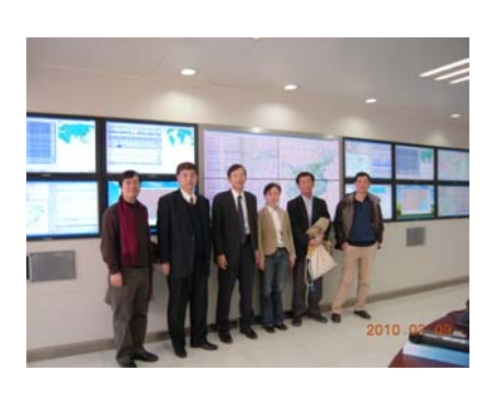
China Earthquake Networks Center