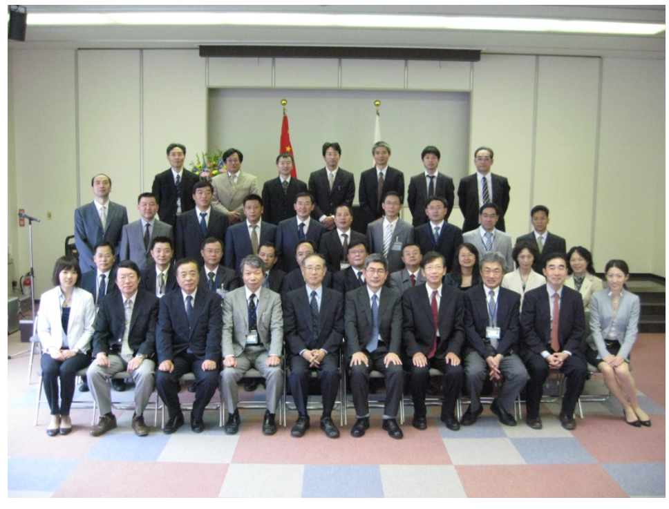
Group photo at the opening ceremony

This is a two-month training course, and this time we invite 20 participants from all around China. They will study "Seismic Resistant Design" and "Seismic Evaluation and Seismic Retrofit" in the IISEE for two months. They are expected to disseminate the antiseismic technologies into all over China, which they will acquire in this course.