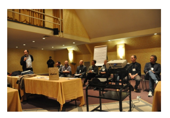
Panel discussion after the poster session