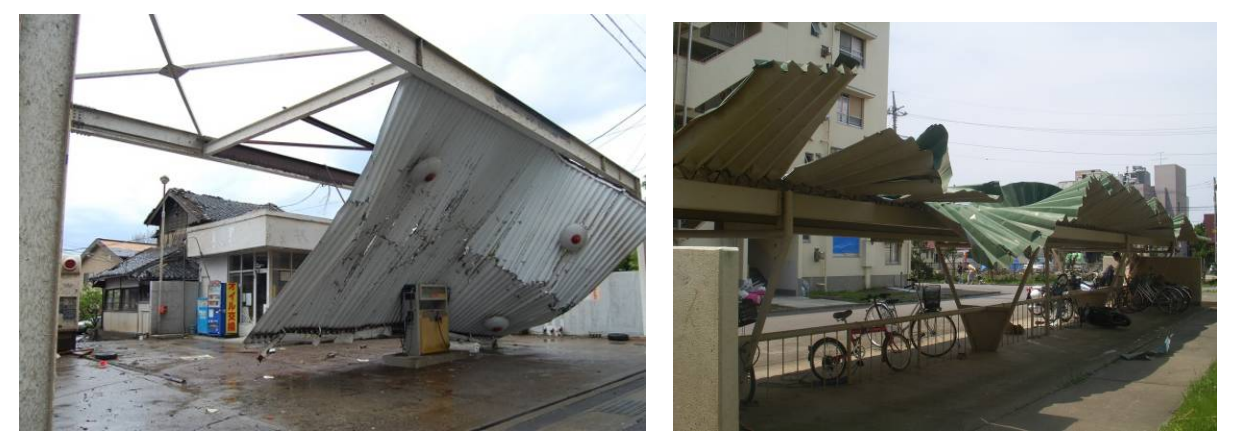
Photo 30 Collapse of a gas station roof Photo 31 Heavy deformation of roof of a bicycle park

The followings are of additional cases to the previously introduced ones within sections 4.4. Photos 30 and 31 show collapse of a roof at gas station and heavy deformation of roofing materials at a bicycle station, Photo 32 shows collapsed stone fence, Photos 33 and 34 show broken electricity poles, Photo 35 indicates broken trees and Photos 36 and 37 indicate rolling cars etc. Photo 33 shows continuous broken electricity poles or inclined ones while Photo 34 shows the situation of broken electricity pole affecting a neighboring house. Turnover of not only light vehicles but also heavier vehicles and a truck was observed. (Photo 37)