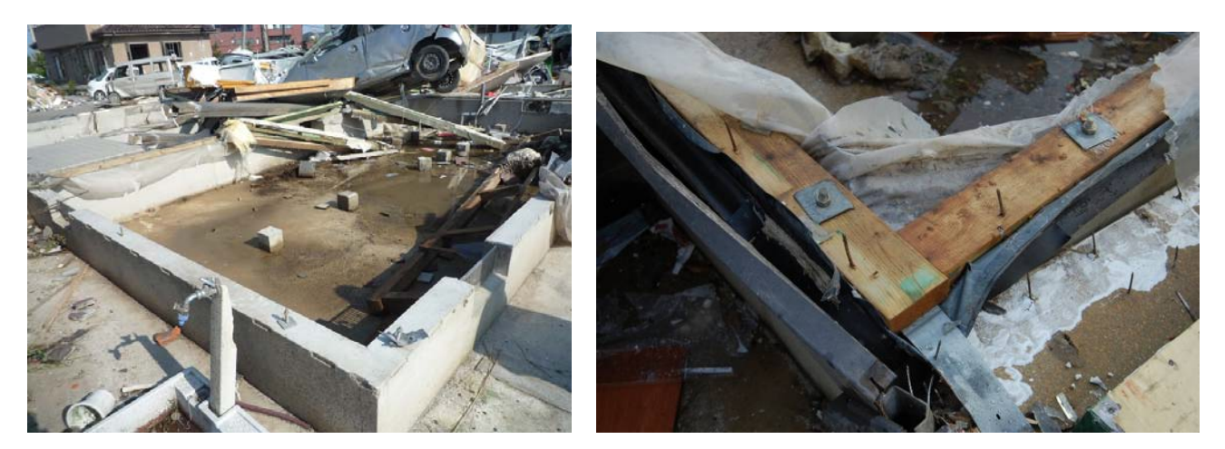
Photo 5 Wooden Building D Photo 6 Remaining foundation beam of Wooden Building D