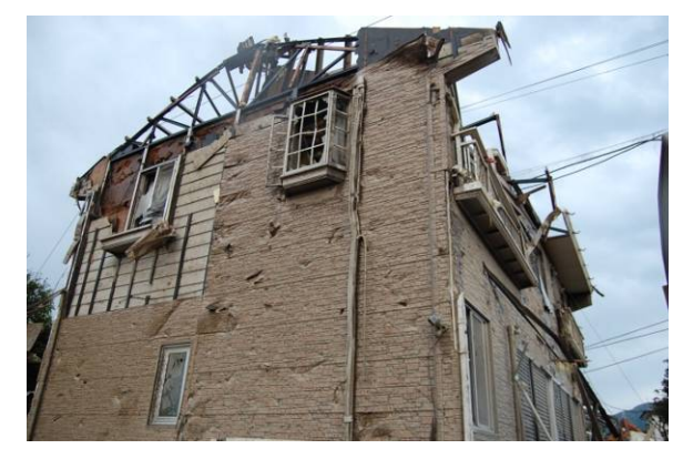
Photo17 Steel Framed Building A