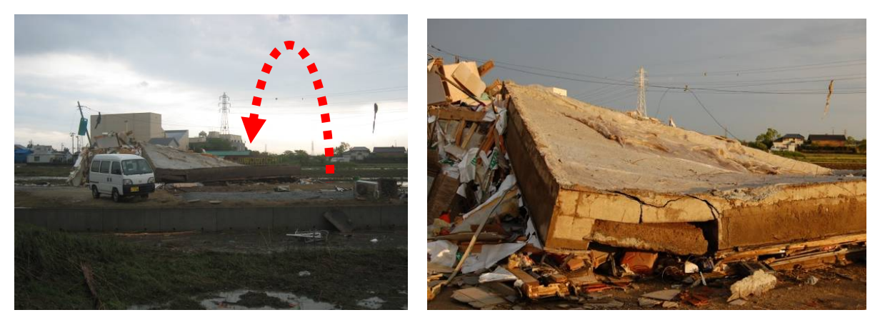
Photo 1 Wooden Building A Photo 2 Turned flat basement of Wooden Building A Note: A light vehicle in front of the building A was parked at the investigation.