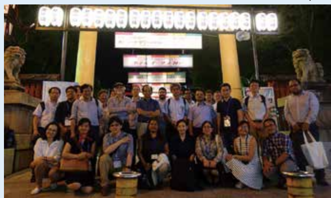
IAG-IASPEI 2017 (Kobe, Japan)