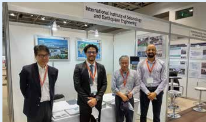
17WCEE (Sendai, Japan)

When a major international conference is held, IISEE holds a reunion to meet IISEE alumni and exchange information and deepen friendship.