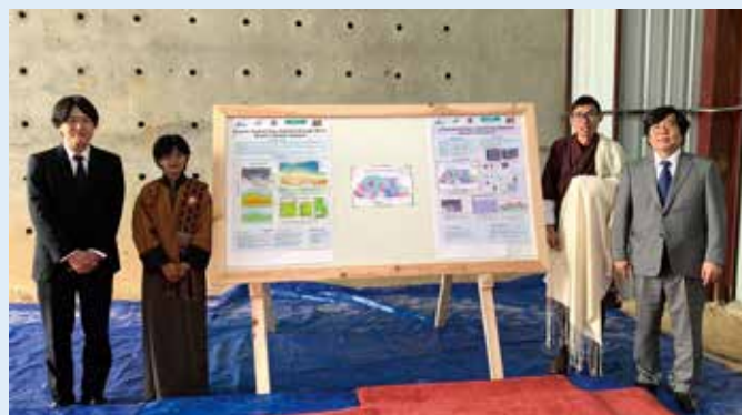
SATREPS Program (Bhutan)

IISEE is following up former participants and conducting collaborative researches throughout international technical cooperation programs.