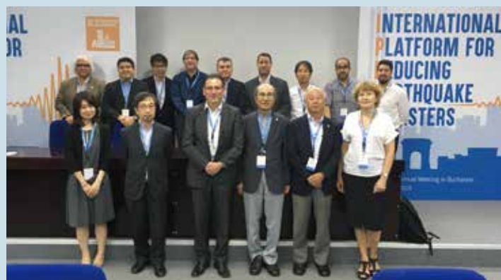
IPRED11 in Bucharest, Rumania (June 2019)