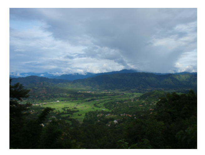
Pgoto 1: Kathmandu basin