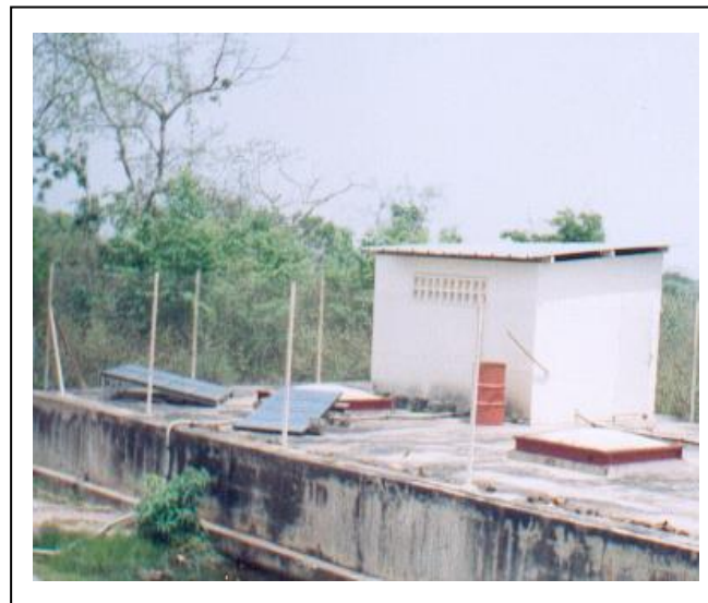
Figure 3. DBIC (PS15) Station