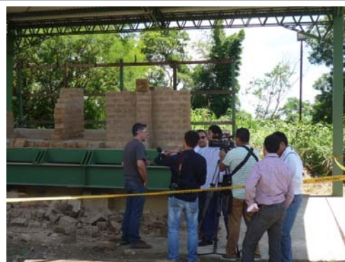
Photo 3 Interview after Tilting Table Test of Adobe Wall Specimens (UES)