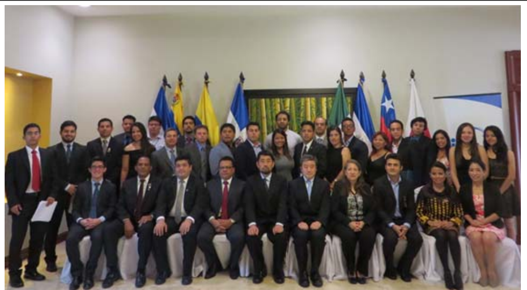
Family Photo after Closing Ceremony