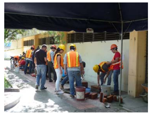
Photo 2 View of Making Prism Test