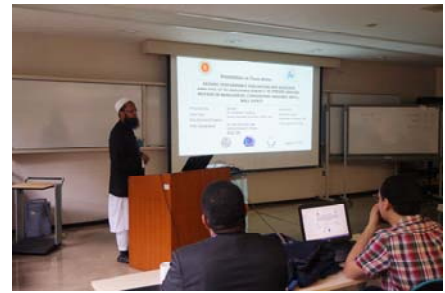
Presentation of Gazi from Bangladesh