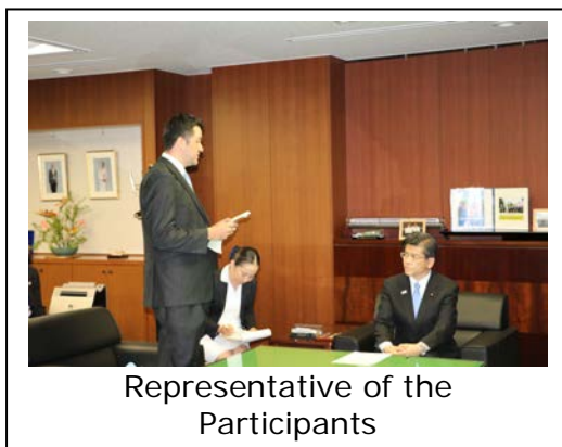
Representative of the Participants