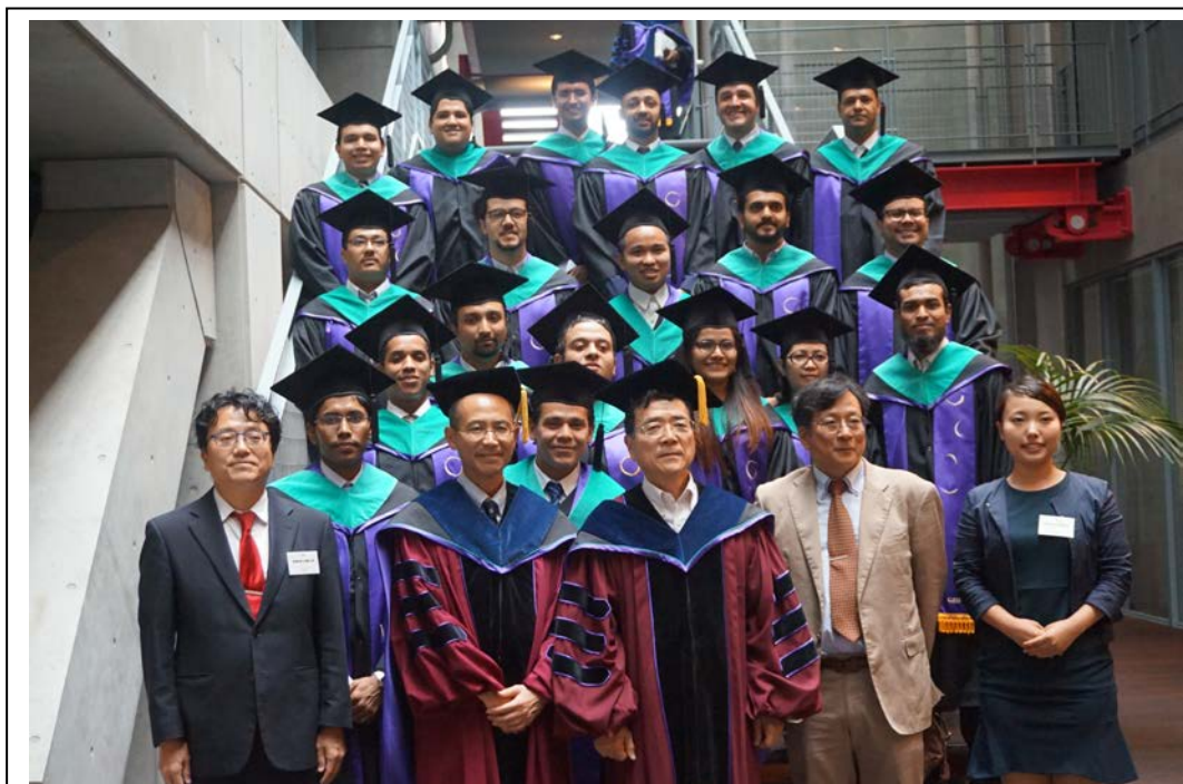
GRIPS Graduation Ceremony

We appreciate everyone for understanding and cooperation to conduct this training course. Thank you very much.